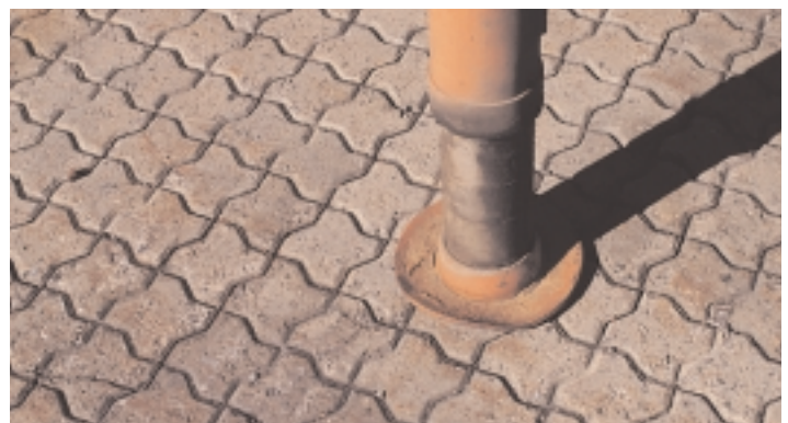
Truck trailer legs place point loads on the four year old interlocking concrete pavement with no damage in most areas.