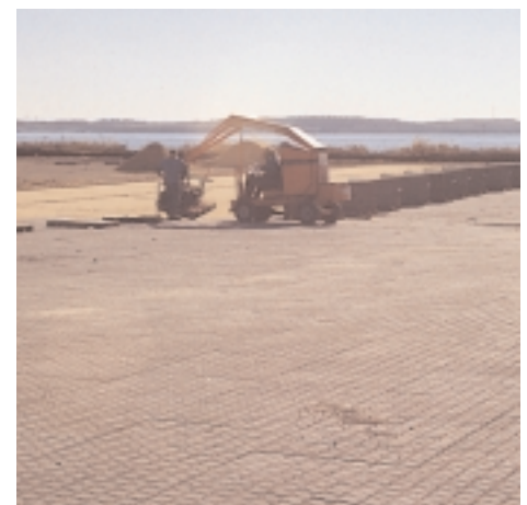
Like the past projects, recent construction of paving at Seagirt used mechanical equipment placing concrete pavers manufactured and stacked in the final laying pattern.