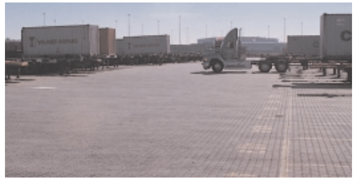
In 1997, the next install installment was about 560,000 sf (56,000 m 2 ) at Seagirt, now used for storage of truck chassis.

In 1997, a 5 ft. (1.2m) layer of sand on geotextile was placed as sur-