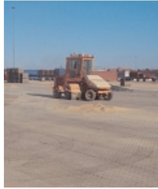
The contractor used a large sweeper to spread the fine sand into the joints between the millions of concrete pavers.