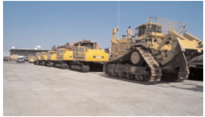
High abrasion resistance to steel tracked equipment is why over a half a million square feet (over 50,000 m 2 ) of concrete pavers were used at Dundalk in the Port of Baltimore.

charge (weight) over the entire area of soil. The weight of the sand slowly compressed the soil and pushed excess water into wick drains in the soil. The weight of sand on the dredged soil caused settlement in the soil as much as seven feet (2.1 m) in some places.