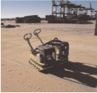
After an area was paved, large plate compactors like these compacted the concrete pavers into the bedding sand. The machines were also compacted the units again after the joints were filled with sand.