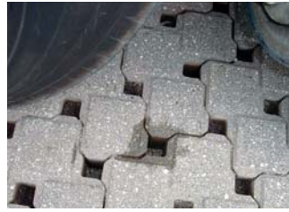
Before cleaning and after cleaning at Morton Arboretum