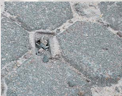
Clean aggregate is found just below the sediment trapped at the surface of the Eco-Stone openings

The rate of sedimentation will vary depending on the amount of traffic and whether sediment is deposited onto the pavement from adjacent areas. Some PICPs may not require cleaning for several years as they remain capable of adequate infiltration. Research conducted by James and Gerrits 2003, Borgwardt 2006, Bean, et al. 2007, and Shackel 2009, demonstrated that PICP up