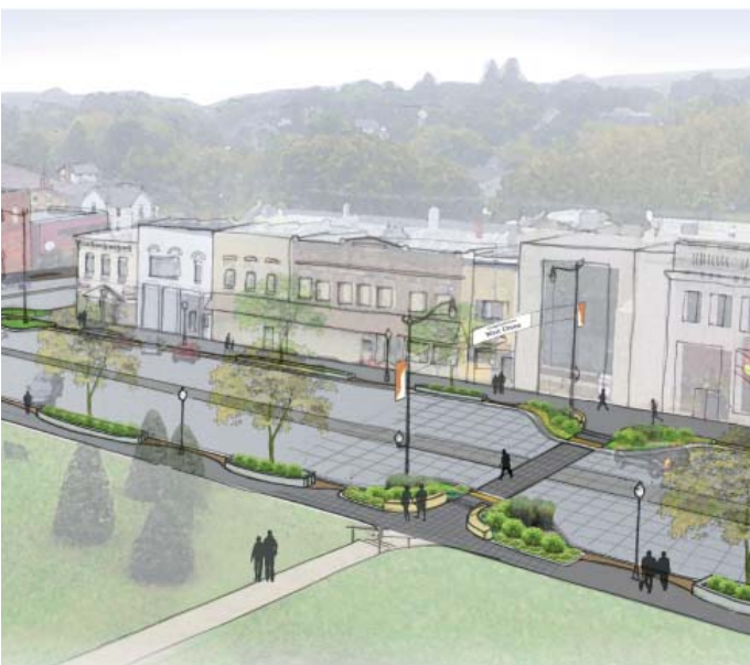
Streetscape perspective from Courthouse

The Iowa Green Streets Pilot Project is a community-wide sustainability initiative to serve as a catalyst for further investment in the historic downtown of West Union, Iowa. The project began with a visioning workshop in October 2007 when Iowa's Department of Economic Development (IDED) completed a Technical Assistance Visit to advise West Union about the potential for multi-purpose pedestrian-scale streetscape improvements. The result of the initial visioning and the subsequent Conceptual and Schematic Planning was a Streetscape Master Plan, which has led the Pilot Project, now in the construction documentation stages.