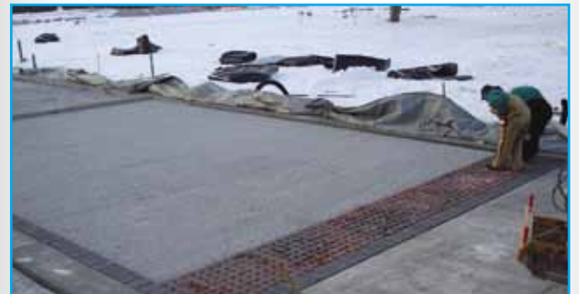
Installation can occur in freezing temperatures over unfrozen subgrade, shown here in Moline, IL.