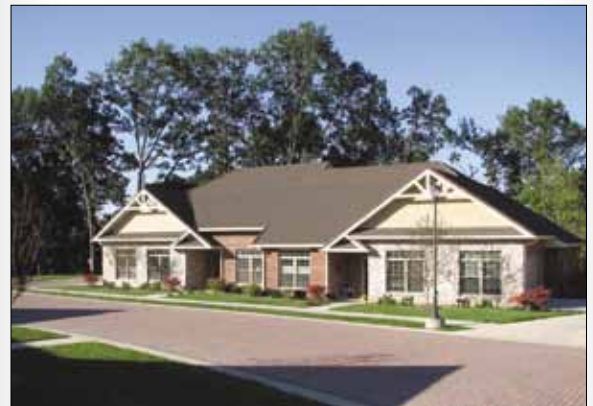
39,000 sf (3900 m 2 ) PICP street in Autumn Trails, Moline, IL eliminated the need for storm sewer inlets and pipes.