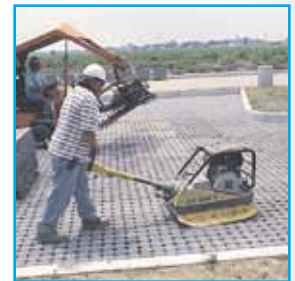
Mechanical installation speeds construction. Aggregate base and subbase are spread and compacted; pavers are delivered ready to install. After placement, joints and/or openings are filled with small aggregate and pavers compacted at this Walmart in Rehobeth Beach, DE.