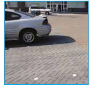
Stormwater treated in drive and parking space areas in Vancouver, BC shopping center.