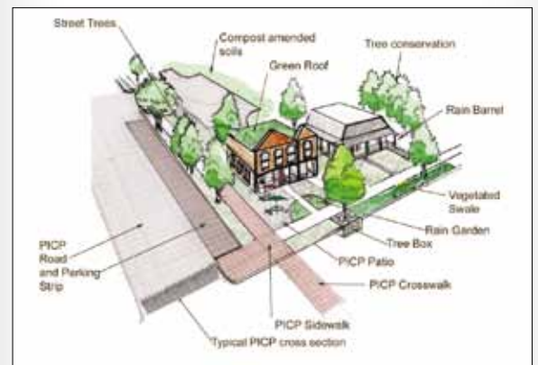
PICP locations in a sustainable approach to site development