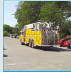
PICP is strong and durable.