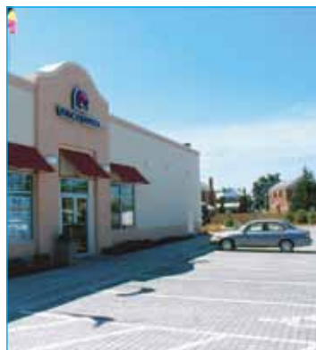
Permeable interlocking concrete pavement at this fast food restaurant in Baltimore, MD treats stormwater before entering the Chesapeake Bay.