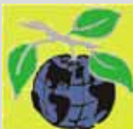
The Low Impact Development Center, Inc.

Disclaimer: The content of this brochure is intended for use only as a guideline. It is not intended for use or reliance upon as an industry standard, certification or specification. ICPI & LIDC make no promises, representations or warranties of any kind, expressed or implied, as to the content of this brochure. Professional assistance should be sought with respect to the design, specifications and construction of each permeable interlocking concrete pavement project.