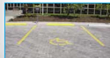
PICP complies with ADA, as shown in this university parking lot in Vancouver, BC.