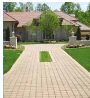
PICP driveway in NC creates an attractive and environmentally responsive entrance.