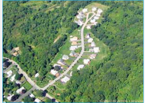
With no detention pond, layout conserves trees while 15,000 sf (1500 m 2 ) PICP in the cul-de-sac returns rainfall to the water table in Glen Brook Green subdivision in Waterford, CT.