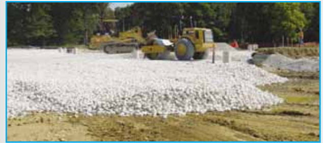
Base construction uses locally available materials.