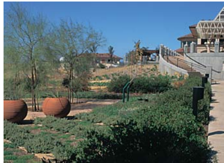
Divided into four quadrants, the garden is built around historical Greek principals of the elements - water, earth, sun and wind

Project specifications called for the 3 1/8" (80 mm) thick UNI Eco-Stone® pavers to be installed on a 1" deep bed of washed concrete sand conforming to ASTM C33, which was also combined with 2-5 mm aggregate to fill the drainage voids and joints. Existing concrete from the site was crushed and recycled for use as the base material and installed