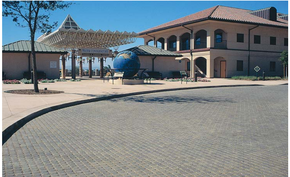
UNI Eco-Stone® pavers were selected for the Rio Vista Water Treatment Plant parking lot

When building their new water treatment plant in 1994, the Castaic Lake Water Agency wanted a state-of-the-art facility that would serve the needs of the Santa Clarita Valley in southern California for many years to come. Located in a rapidly growing area that is subject to droughts and other emergencies that affect the water supply, the agency decided to build with the future in mind.