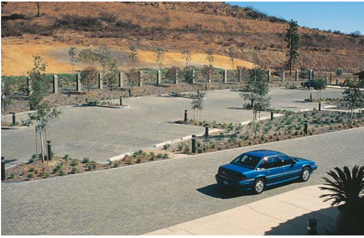
UNI Eco-Stone® pavers function as part of a drought-tolerant landscape

The unique, patented design of UNI Eco-Stone® utilizes infiltration as a natural way to reduce stormwater runoff, recharge groundwater storage, improve water quality, and mitigate pollution impact on surface waters. Available nationwide through UNI-GROUP U.S.A., one of the country's leading interlocking concrete paver producer organizations, UNI Eco-Stone® is manufactured to meet or exceed ASTM C-936 specifications.